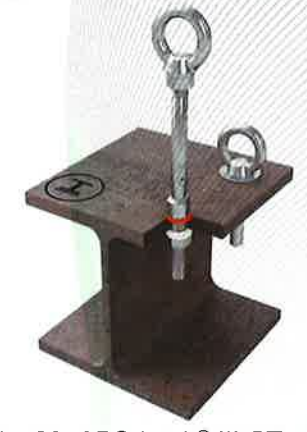
Fig. 20: ABS-Lock® III-ST