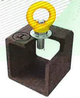
Fig. 12-13: ABS-Lock® III-R-ST