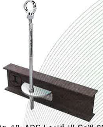
Fig. 18: ABS-Lock® III-Seitl-65 steel