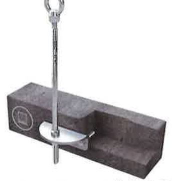
Fig. 16: ABS-Lock® III-Seitl-65 concrete