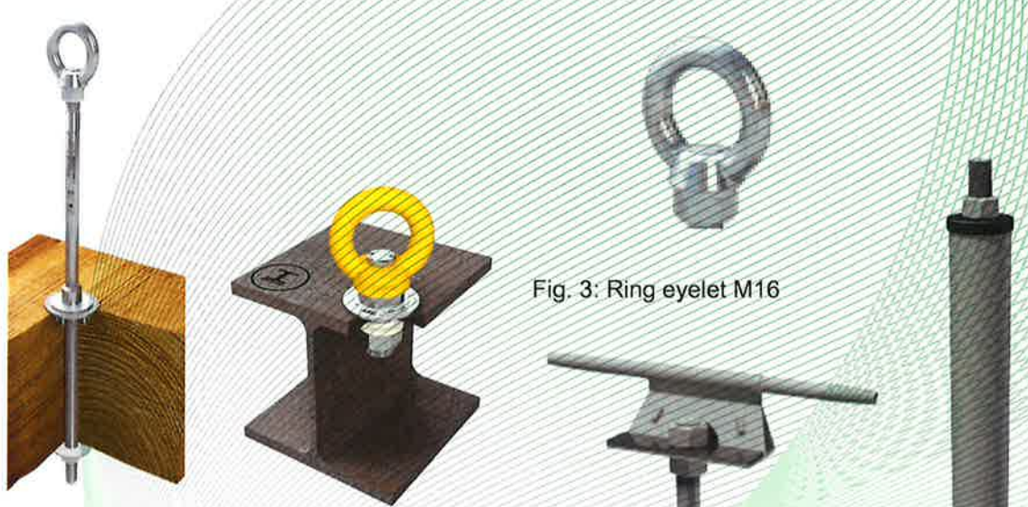
Fig. 1-2: Two of the possible anchor devices of type ABS-Lock® III

The user can protect himself against falls from a height by connecting his personal protective equipment to the ring eyelet. The single anchor point is so designed that, when combined with the wire rope systems ABS-Lock® SYS I to SYS IV (Fig. 6), it can absorb the forces to be expected if it is loaded by the fall of a person. In such applications the anchor device is used as an end anchor, structural intermediate anchor and curve anchor in wire rope systems according to EN 795:2012 Type C made by ABS Safety GmbH. Instead of the ring eyelet, the respective wire rope anchor guide components (Fig. 4) can be mounted. In such cases, a support pipe as shown in Fig. 5 can be connected to the support of the end and curve anchors of the anchor device of type ABS-Lock® III. The anchor device is made of corrosion-resistant steel.