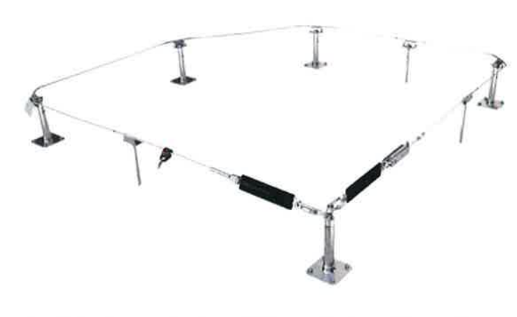
Fig. 6: Anchor device type ABS-Lock® III combined with wire-rope system of type ABS-Lock® SYS