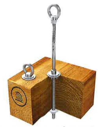
Fig. 14: ABS-Lock® III-HW