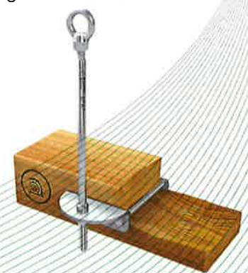
Fig. 17: ABS-Lock® III-Seitl-65 wood