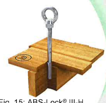
Fig. 15: ABS-Lock® III-H