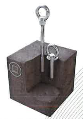
Fig. 7: ABS-Lock® III-B