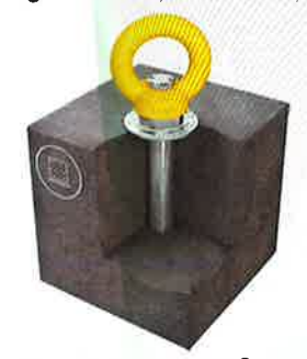
Fig. 11: ABS-Lock® III-R-B