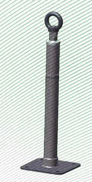
Fig. 2: Anchor device, type: ABS-Lock® X-SR with extension