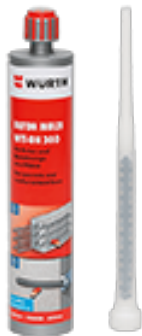
Special Adhesive WIT Special Adhesive for concrete and masonry