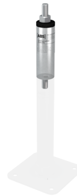
ABS-Lock X-SR Extension Extension for an ABS-Lock X-SR anchorage point