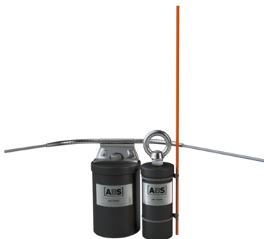
ABS Therm & ABS Signal Thermal protective cover & signal rod for fall protection anchors