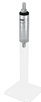
ABS-Lock X-SR Extension Extension for an ABS-Lock X-SR anchorage point